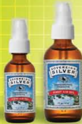
1 fl. oz. / 30 ml First Aid Gel

Keep one bottle in your bathroom cabinet, one in your car, and one in your purse or briefcase, so you'll always be prepared for life's little accidents.